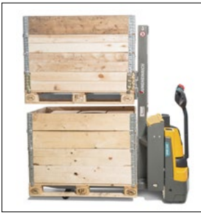
Double-deck operation – loading of two pallets one over the other