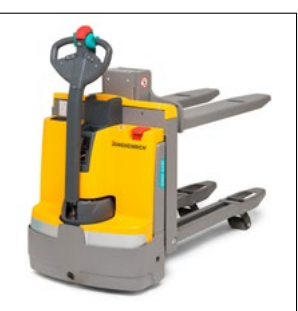
Short EMD 115i mast for ergonomic order picking up to a height of 690 mm