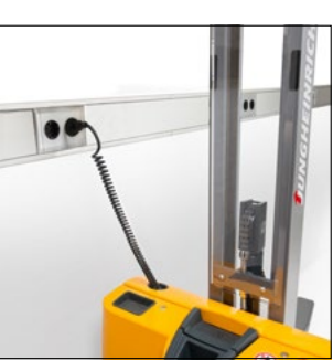
Easy charging at any 230 V mains socket thanks to on-board charger.